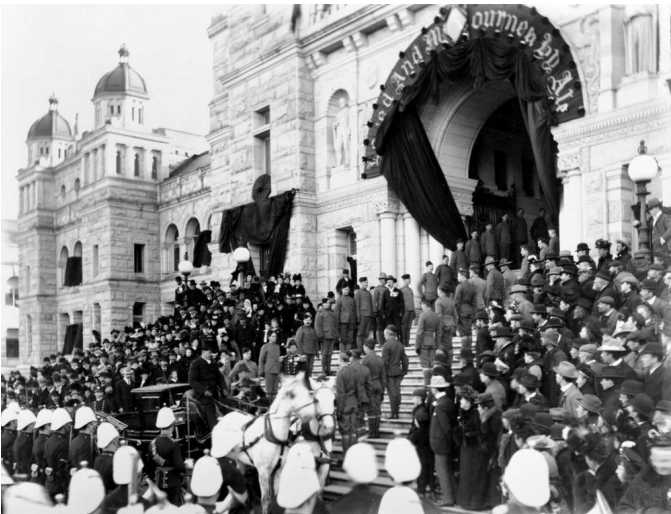
Image: Memorial service for Queen Victoria at the BC Parliament Buildings

Queen Victoria passed away on January 22, 1901, and memorial services were held in Victoria on February 2 at all city churches and the BC Legislative Buildings. The front entrance sign reads "Loved by All and Mourned by All".