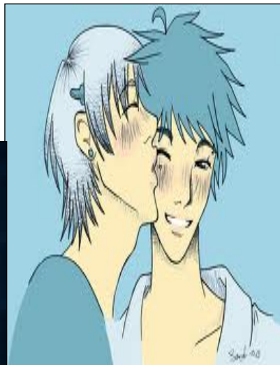
Artwork by SarutDX