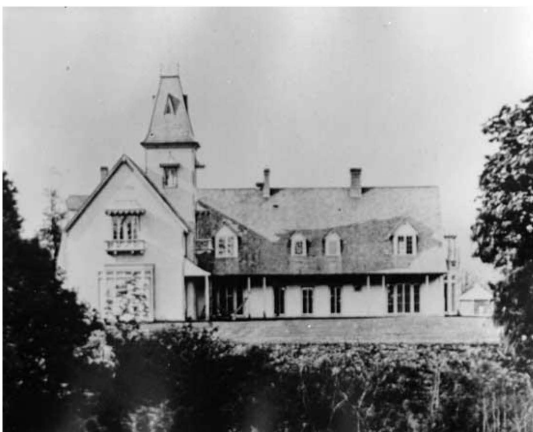
Image: Government House – south view (New Westminster Archives IHP1714-09, c. 1865)