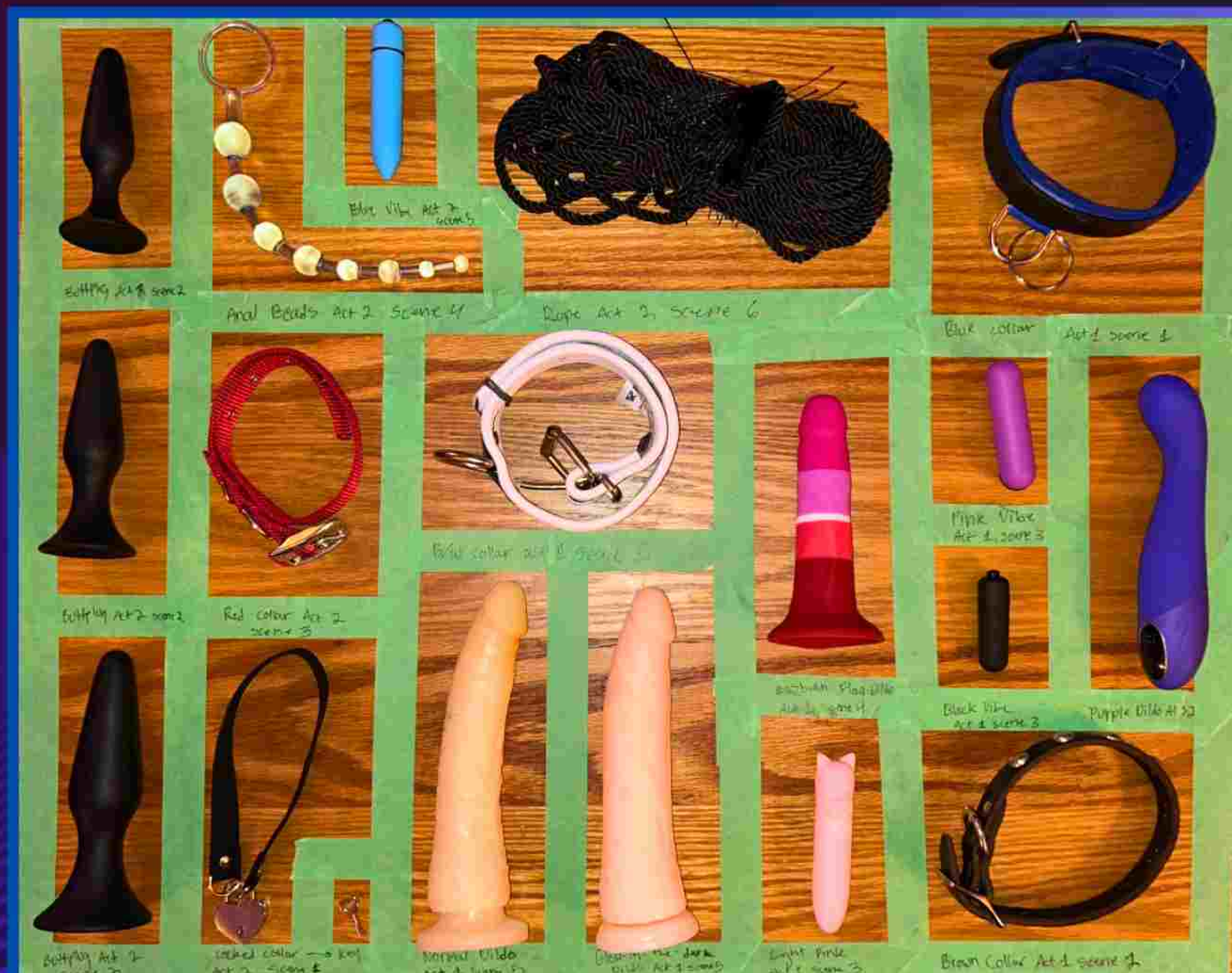
Newell, El. "An Erotic Webcammer's Prop Table" November 20th, 2023