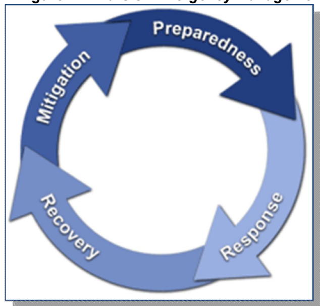
Figure 1: Pillars of Emergency Management

Despite the recognition that the pillars of emergency management do not necessarily occur independently, a circular figure is often still used in defining emergency management. Conceptually, such an understanding of the four pillars does not take into account the interconnected nature of the tasks completed by emergency managers. Furthermore, defining the pillars as distinct can lead to priorities being set based on artificial distinctions. Emergency management in Canada has traditionally focused on preparedness and response. 35 In recent years, there has been a shift in emphasis towards prevention and mitigation measures in order to reduce the social and economic costs of disaster events. As McEntire and Marshall suggest, however, focusing on proactive