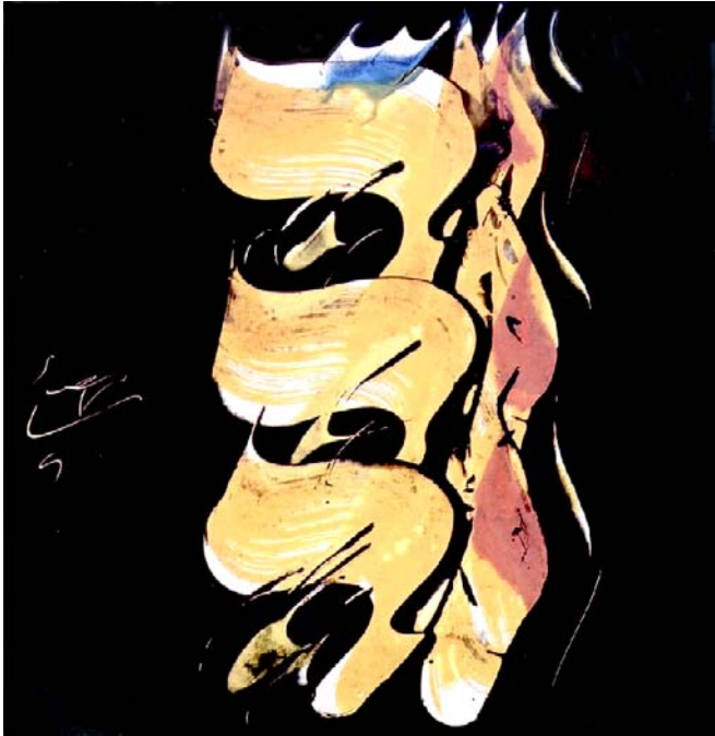
Fig. 6: Dastafshani series , yellow/vermillion gouache, black enamel on mat board, 50x50 cm