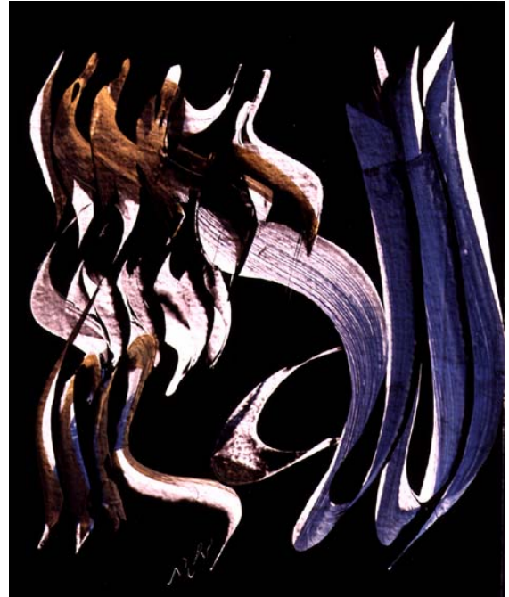
Fig. 4: Dastafshani series, blue gouache, black enamel on mat board