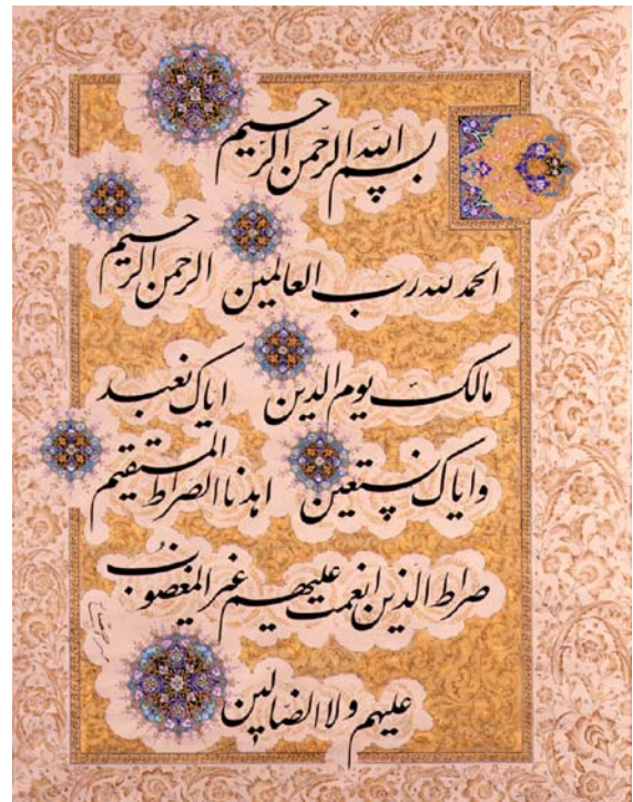
Fig 9: Opening sura of the Quran, black ink on pink paper