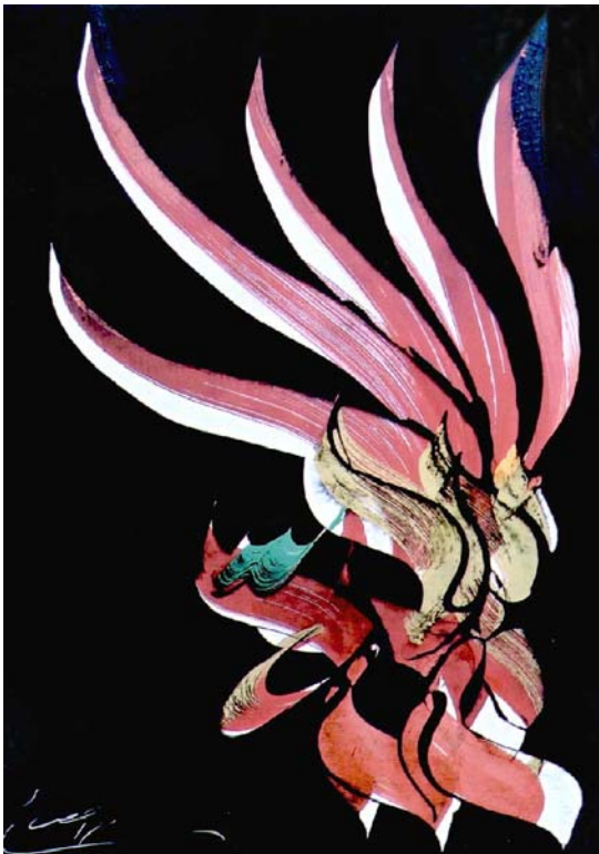
Fig. 3: Dastafshani series, red/ochre gouache, black enamel on mat board, 50x70 cm