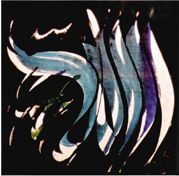
Fig. 2: Dastafshani series, teal/blue gouache, black enamel on mat board, 45x45 cm