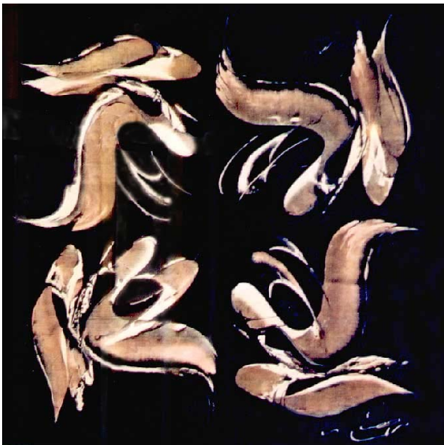
Fig. 7: Dastafshani series , peach/grey gouache, black enamel on mat board, 70x70 cm