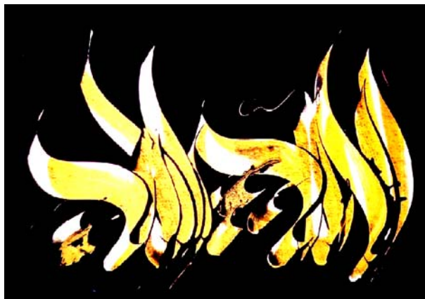
Fig. 1: Dastafshani series, yellow gouache, black enamel. on mat board. 50x70 cm

A review of an exhibition of contemporary Islamic calligraphy as abstract painting by S. Mohammad Ehsaey at the Ziba Art Gallery, Vancouver, February 9 – March 7, 2002.