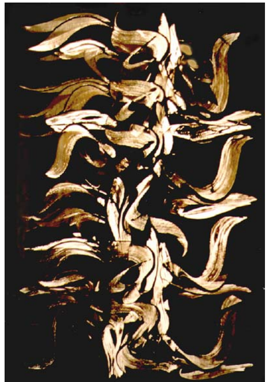
Fig. 5: Dasafshani series, black enamel on board, 70x100 cm