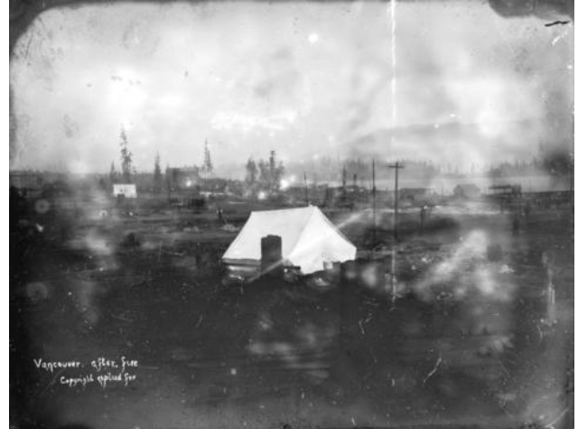
Image: Vancouver after fire (City of Vancouver Archives, LGN 455, June 14, 1886, attributed to H. T. Devine)

Peter O'Reilly writes, "The town of Vancouver burnt down"