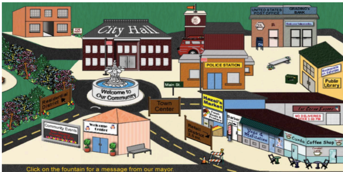
Figure 2. Excerpt of graphic on the course homepage in Blackboard (color figure available online). (p. 77)

The core requirement course Child, Family, and Community was chosen to integrate scenario-based learning integration, as the topics were ideal in that they “span a variety of content domains and readily lend themselves to multiple paths of investigation as well as multiple answers and solutions to dilemmas” (p. 76), and was delivered via Blackboard. The course interface in Blackboard was restructured around an interactive virtual community (see image below), wherein students could click buildings to ‘enter’ them and access scenarios and corresponding information. The chart on the following page describes the corresponding material each structure was associated with.