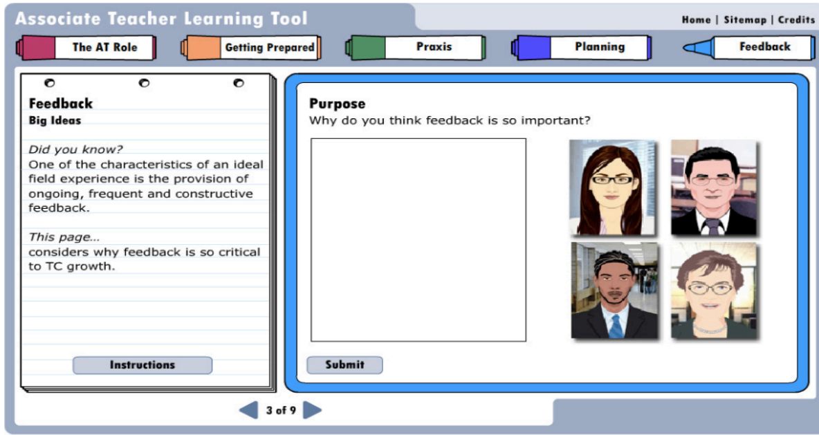
Figure 3: Example of reflective text input

One important aspect of the 2013 study was that the database software MySQL was used to track user information such as frequency and time of visits, which pages were visited, and which open-ended activities were completed. Important usage findings include: