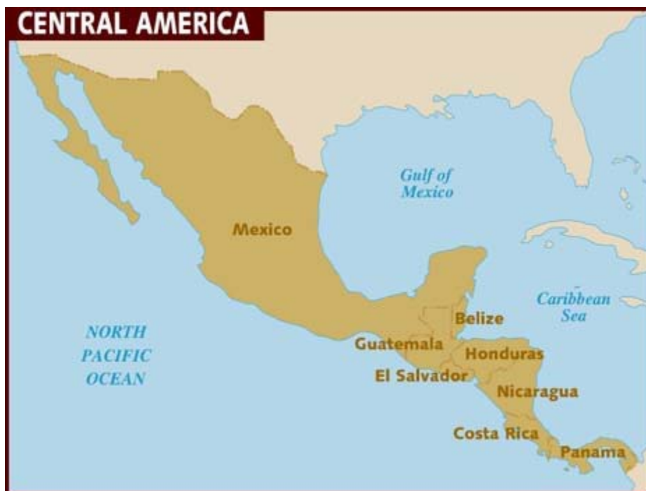
Figure 1 Map of Central America showing Belize's location in the world

I have discovered birthplace in the world has little, if any, to do with level of intelligence. There are people in every country in the world who are able to think for themselves and make important decisions. I suggest however, the degree of opportunity, education and experience varies from country to country. Specifically, teachers in Belize simply have not been exposed to the many resources, techniques and strategies available to most educators in Canada. My work with TFABB, years of experience as a teacher and extensive travel, came together, providing the time and place where I was able to put my wondering into action.