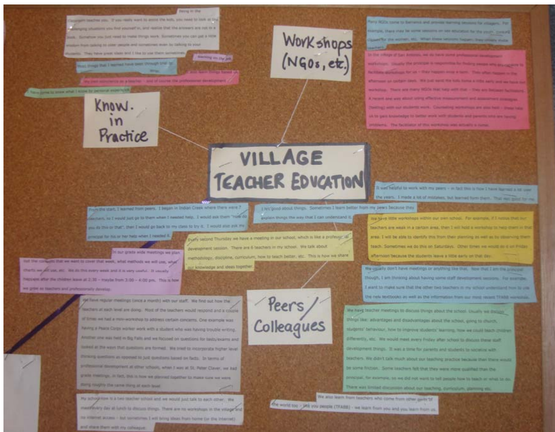
Figure 6 Taxonomic analysis of village teacher education