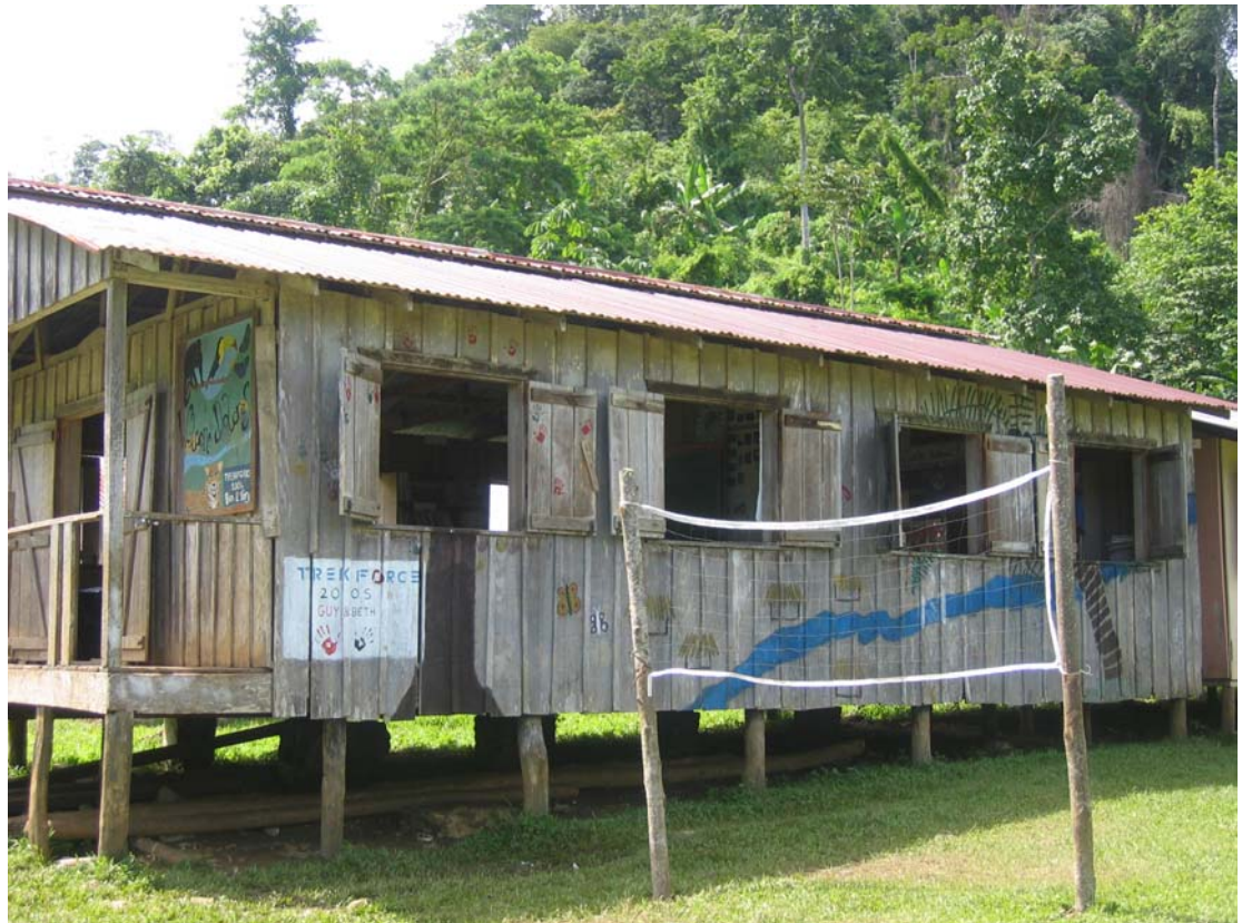
Figure 4 School in the rural village of Dolores, Toledo

In Belize there are six administrative districts: Belize, Cayo, Corozal, Orange Walk, Stann Creek and Toledo. Each district has its own board of education governing the schools. An Education Officer is in place in each district to oversee all schools in his or her district. There are about 270 primary schools in the country, 30 secondary schools and five tertiary institutions (Iyo, 2000). In the southern and most isolated district of Toledo, 90% of all primary schools are located in what could be considered very rural areas. Many teachers travel great distances daily to the schools in which they teach. At times, teachers are not able to locate transportation to school, resulting in a class of students without a teacher. Figure 4 shows a school in Dolores, Toledo, a remote inland village approximately five kilometers from the Guatemalan border.