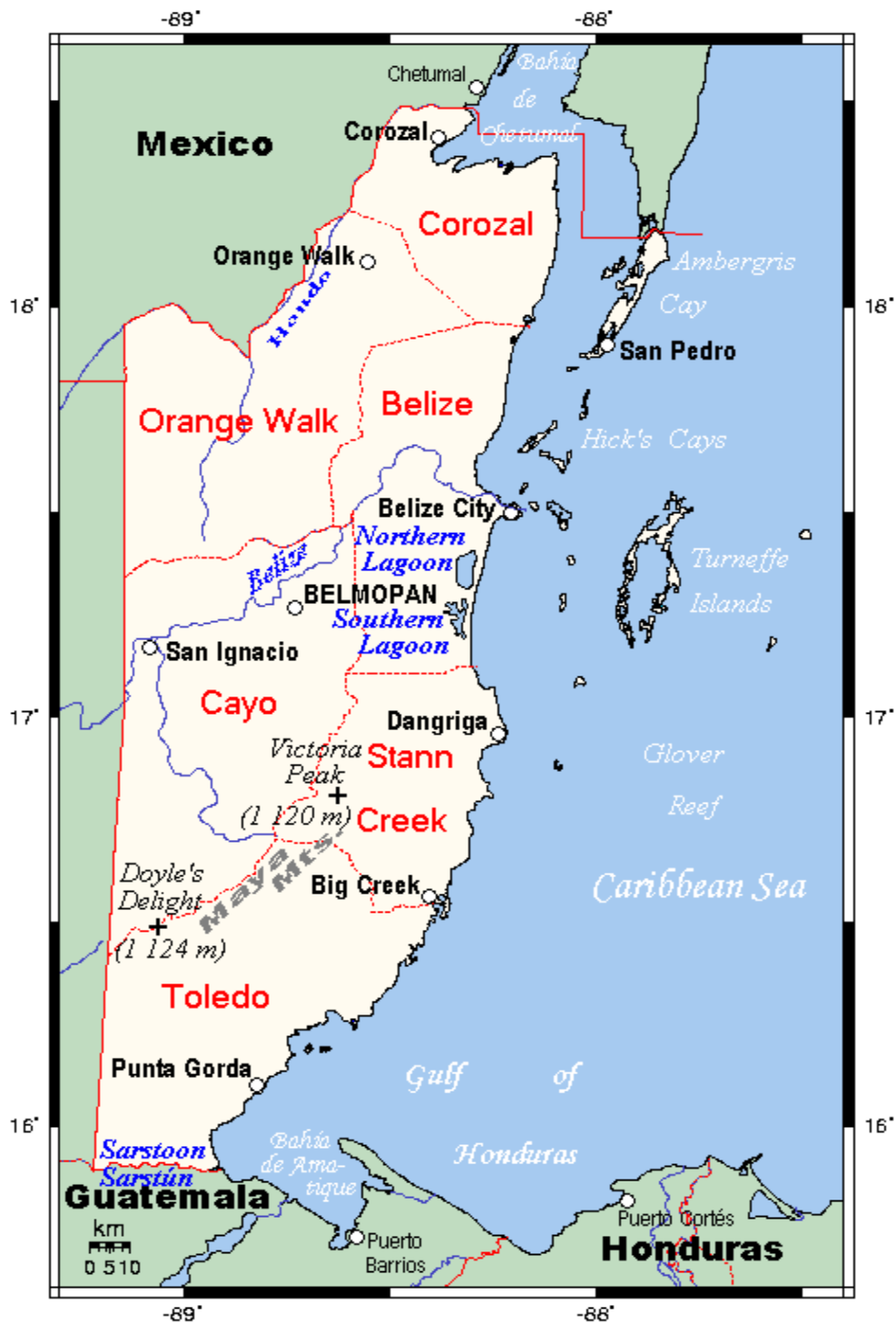
Figure 2 Map of Belize showing the Toledo District in the south

In the district of Toledo there are more than six distinct languages spoken. Two-thirds of its inhabitants speak either Q'eqchi' Maya or Mopan Maya as their first