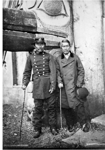
Image: Chief Nanjingwas wearing a naval uniform (left) and another man, probably Chief Skidegate VII, stand before the former's Raven crest at Chief's House in Skidegate (BC Archives D-04292, July 1881)

A Haida village on southern Graham Island of the Queen Charlotte Islands (Haida Gwaii).