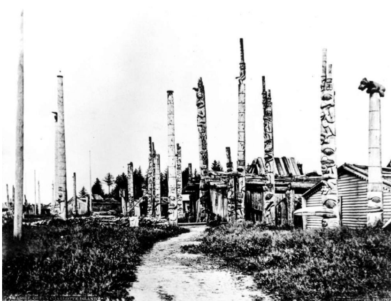
Masset, Queen Charlotte Island (, July 1881)