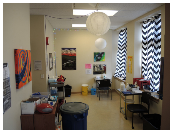
Fig. 1. The harm reduction service's OPS, with two injection stations showing.

The general mandate of all OPSs is to provide access to supervised injection services and overdose responses, harm reduction supplies, and