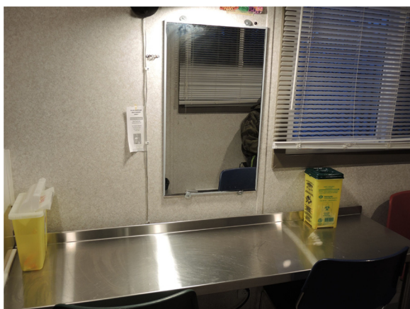
Fig. 2. Two of the three injection stations at the drop-in centre's OPS, set up for two people to use next to one another.

The first site opened its OPS in a large room adjacent to its drop-in harm reduction program and high-volume needle distribution service, thereby extending existing harm reduction services to include supervised injections. The room initially housed three injection stations, later increased to four. The harm reduction program includes staff hired specifically for their lived experience of drug use. The initial funding limited operating hours to 3:00pm to 9:00pm daily (Fig. 2).