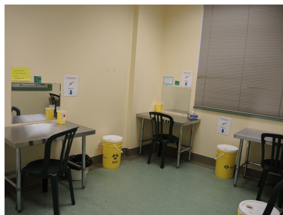
Fig. 3. The inner room of the shelter's OPS.

The second OPS at a drop-in centre opened in a half-size shipping container located outdoors in its courtyard. There are three injection stations along a single long table. The drop-in centre contracted a peer-run drug-user agency to develop and deliver the OPS. Staffing included one paramedic hired by the drop-in centre providing emergency care and one peer staff providing overall support services including injection and overdose supports. The site was open 7 days a week between 6:30a.m. and 8:30p.m.