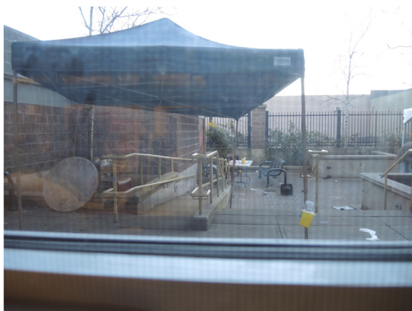
Fig. 4. The safer smoking area outside the shelter's OPS, viewed through the window from the service's outer waiting room.

and possession, one participant pointed out that it took the fentanyl crisis and the deaths of 1000 people to provide what has long been understood by drug-users, harm reduction activists, and academics as a necessary and life-saving service, stating “we’re allowed to open that room because of the overdose crisis. Not because it was needed” [OPS 1:06].