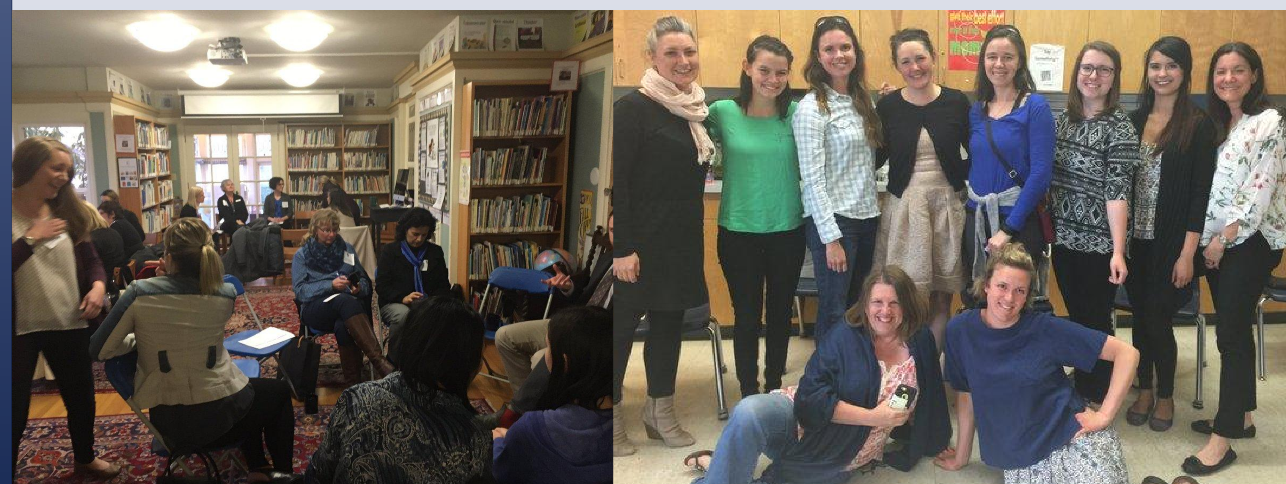
YYJEdChat events at Glenlyon Norfolk School and Colquitz Middle School