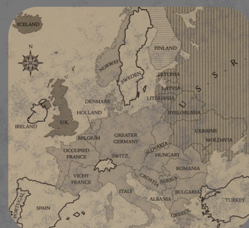
Left: map of Nazi Germany and the Soviet Union, June 1941