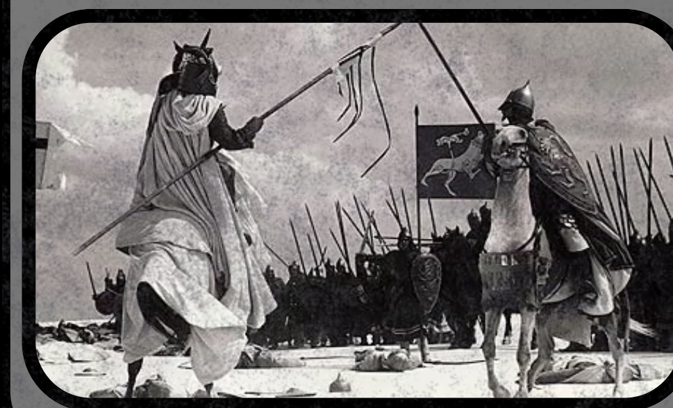
Left: frame from Alexander Nevsky , released December 1938

Both nations repealed films critical of their former foes. The Soviet film Alexander Nevsky (1938), named after the Russian prince who defeated the invading Teutonic Germans in the 13th century, was quickly recalled from theatres following the pact. The Nazi film Legion Condor (1939), a propaganda film on the German exploits against the Communists during the Spanish Civil War, had to cease filming because of its anti-Soviet messaging.