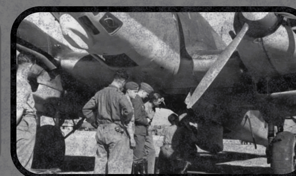
Right: frame from Legion Condor , taken in December 1938