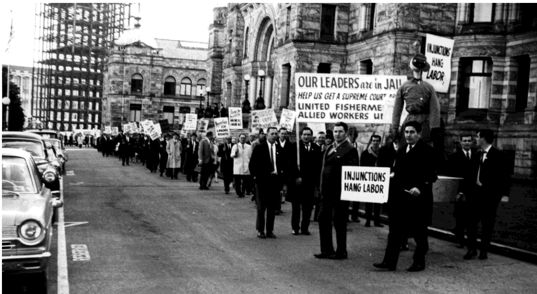
Figure 2. United Fishermen and Allied Workers’ Union (UFAWU) demonstration against injunctions at the BC legislature, 1968.