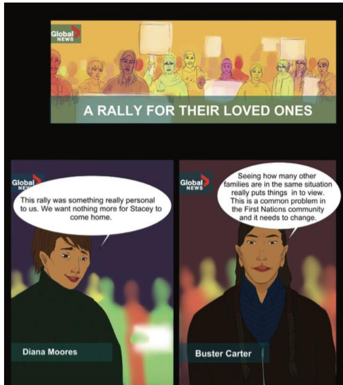
Figure 3. The characters organize a rally for loved ones in Randy’s graphic novel

[w]hen one of the characters decides to take [actions] in his own hands to do what he feels is right to do and he does a protest and gets people together that are in the same situation or kind of the same situation. (Randy, in reference to Fig. 3)