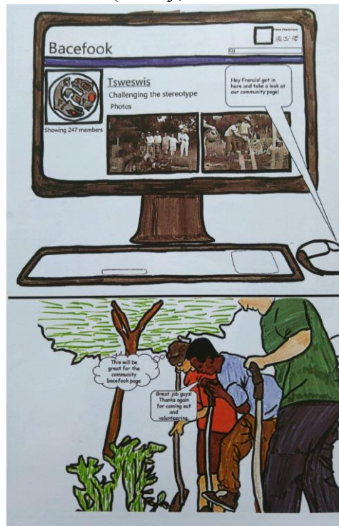
Figure 4. The characters create a Facebook page and take action in Wes’ graphic novel

[w]hen one of the characters decides to take [actions] in his own hands to do what he feels is right to do and he does a protest and gets people together that are in the same situation or kind of the same situation. (Randy, in reference to Fig. 3)