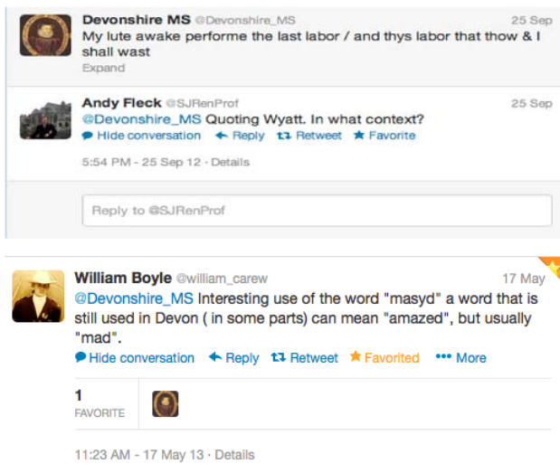
Figure 2. Twitter interaction between @Devonshire_MS and @SJRenProf and @William_Carew.

Perhaps predictably, academic and Wikimedia culture do not easily align. In the current academic environment, job promotion and security rely on tangible records of service. The inability to receive credit for editing in Wikibooks may deter even the most interested feminist scholars from contributing to Wikimedia projects. As one advisor noted,