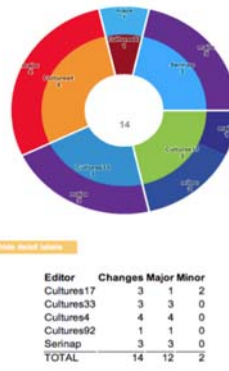
Figure 3. The Magic Circle visualization tool.

The Magic Circle also lets Wiki editors point to the work that they do to help moderate the tone of the Wikibooks editorial discussion and who make the subtle changes that cumulatively fight institutional sexism in the organization of information. Controversy and debate are key to the maturity of a Wikimedia project [Currie 2012, 244], and yet moderating and contributing to debate, which are not so integral to production of a print edition until the peer-review stage, are not usually assigned special credit. In the production of a social edition, however, debate, mediation, and synthesis are so important that they deserve special credit. Contribution to feminist edit-a-thons which, like the ones organized by THATCamp Feminisms conferences and Brown University's edit-a-thon to improve articles about women in science in commemoration of Ada Lovelace's birthday, should not just happen as the additional labor of activism, but rather work in the interest of public which deserves credit [Koh 2013b] [Winston 2013]. The Magic Circle gives edit-a-thons participants visualizations of their labor that they can point to when seeking credit in the academic workplace.