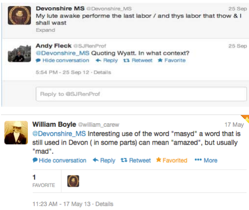
Figure 2. Twitter interaction between @Devonshire_MS and @SJRnProf and @William_Carew.

Perhaps predictably, academic and Wikimedia culture do not easily align. In the current academic environment, job promotion and security rely on tangible records of service. The inability to receive credit for editing in Wikibooks may deter even the most interested feminist scholars from contributing to Wikimedia projects. As one advisor noted,